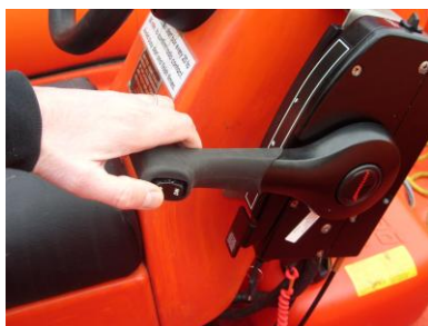
Electric trim & tilt switch (up & down)

The new 30HP Mercury outboard engines are equipped with electric trim & tilt. The trim & tilt mechanism is operated using the switch on the side of the engine control lever (see picture). Ensuring that there is adequate clearance, check that the trim & tilt mechanism works correctly on each engine (Please refer to additional notes below for further guidance on using the electric trim & tilt).